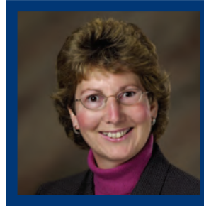
Laura L. Ice '84 Business and Transactional Law Program Fund

"As a result, I felt it was important to carry on the educational efforts of the law school. Because of my teaching in the area of Constitutional Law, I want to broaden the knowledge for those students who will study at Washburn Law in the coming years. The Ahrens fund will assist in this endeavor."