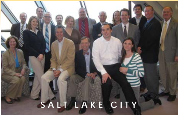
SALT LAKE CITY