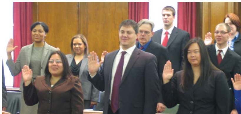
Clinic interns take the oath at the swearing-in ceremony.